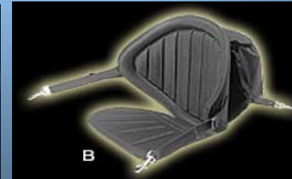
Lo-Back and Hi-Back